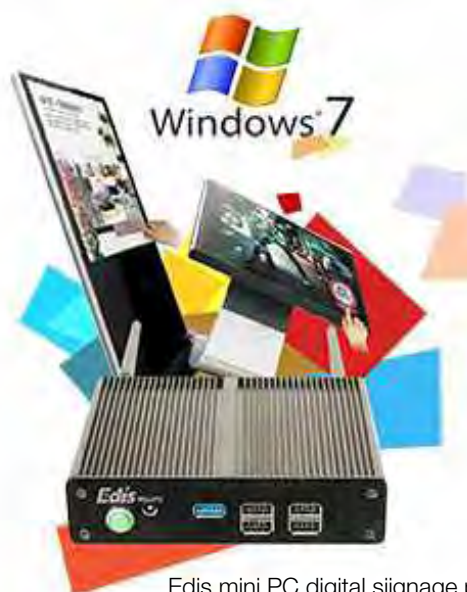
Edis mini PC digital signage player www.edisav.com