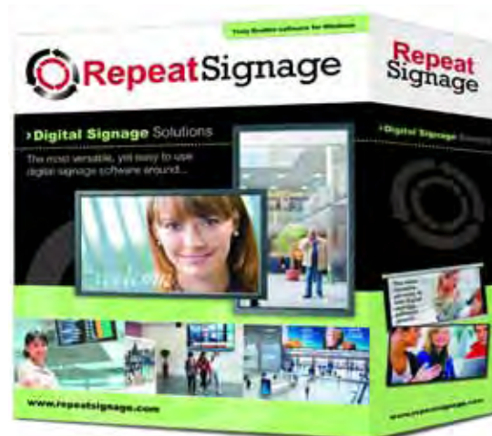
Repeat Signage digital signage software Trial download www.repeatsoftware.com

RepeatServer.com is a free service that allows you to create and host RSS feeds online, free of charge. You can use these for your websites, with desktop RSS readers or in digital signage software. Our news feeds can support Chinese, Japanese, Russian, Greek and other characters. RepeatServer.com was designed with users of Repeat Signage digital signage software in mind so that you can create, host and maintain RSS feeds to be displayed on LCD monitors in public areas. This online portal provides a way for Repeat signage digital signage screens to be updated from anywhere in the world.